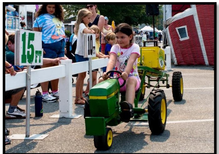
Interactive Family Entertainment

Dedicated Social Media post of presenting day including Logo and link to organization webpage