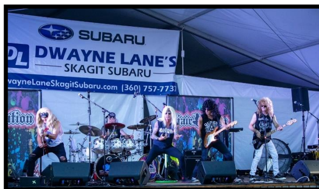
Individual Band Sponsor – Hair Nation 2023

First Aid Tent Community Stage Latino Stage FFA Petting Zoo Cantina Beer Garden Horse Barn Horse Arena Goat Barn Sheep Barn GOAT Playground *NEW *