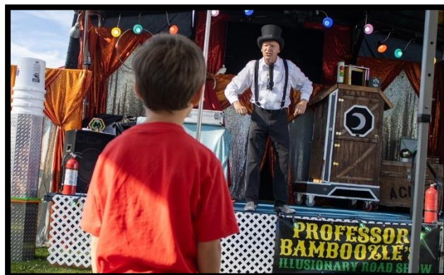
Presenting Free Entertainment Sponsor