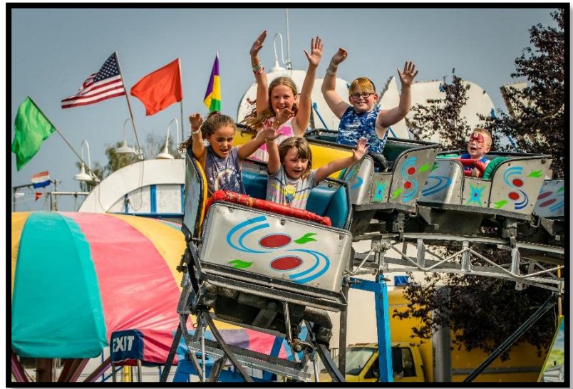
Heart of the Fair...Fun for the whole Family!