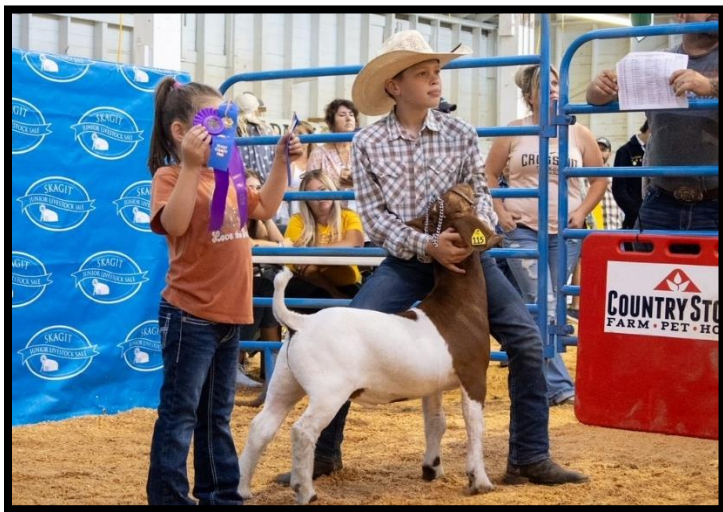
Youth Learning Opportunities at the Fair