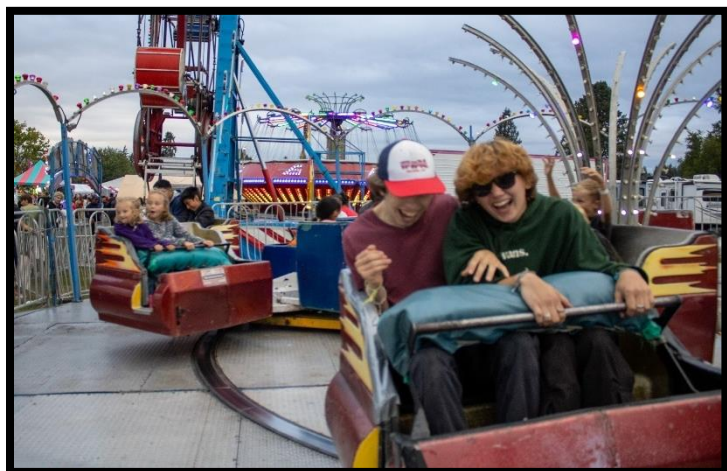
Family Friendly Fun!