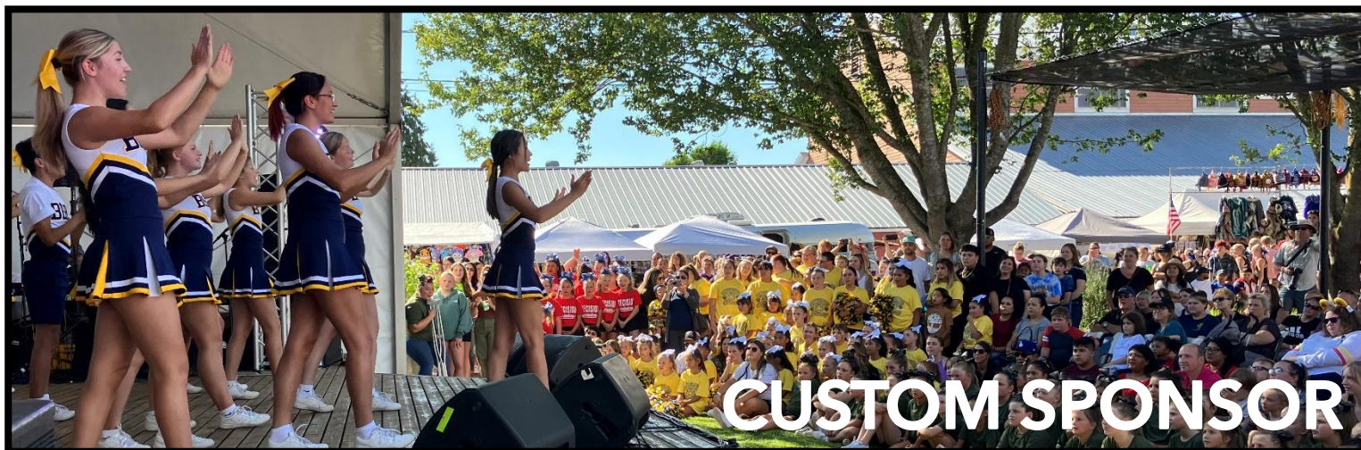
Cheer at the Fair

From engaging entertainment acts, adopting a building, project or being a Presenting Day Sponsor, there are many ways to become involved at the Fair!