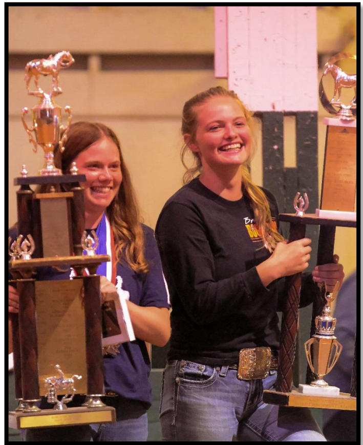
Exhibitors and their goals accomplished!