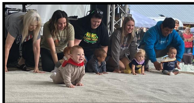
Diaper Derby Sponsor